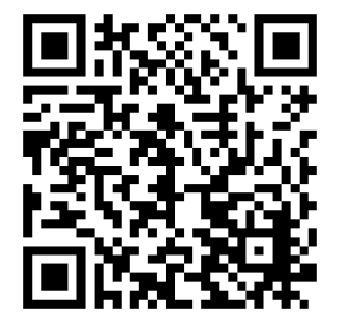
scan QR Code to watch our quick video